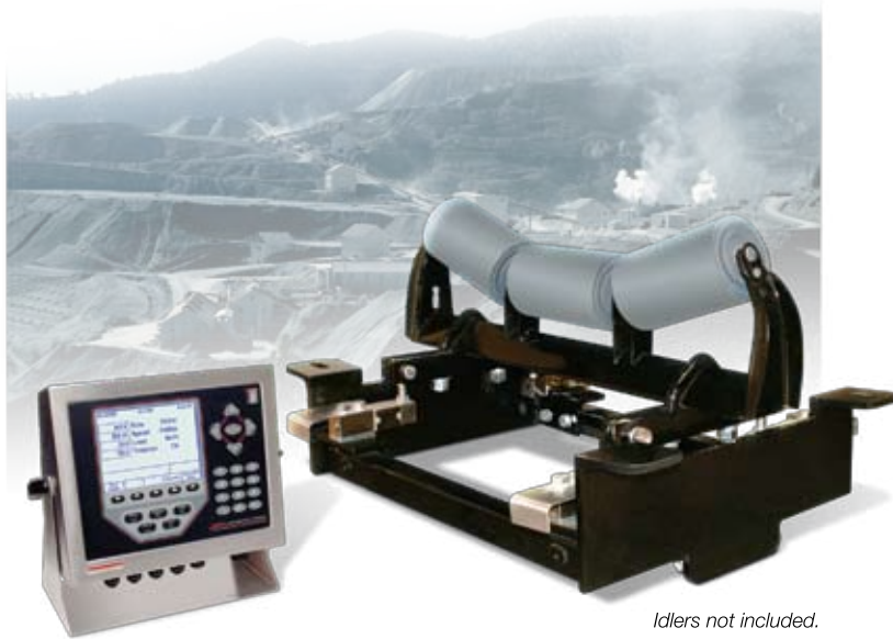
Idlers not included.