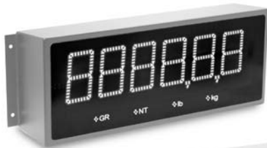
LaserLight 4" digit